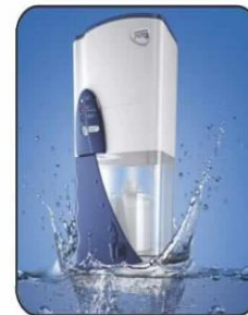
a water purifier

If water is not pure, we must boil it. We can filter water to make it pure.