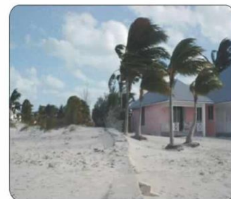
A windy day

Moving air is called wind . Somedays, the wind blows very strongly. These are called windy days . A windy day is mostly cool. These winds sometimes become storms. The trees keep swaying, sometimes the trees fall. We should not go outdoors on a windy day.