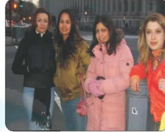
A very cold day

Sometimes it rains and we feel colder. We wear woollen clothes on a cold day. We like to eat and drink hot things. In winters it snow also falls in the mountains.