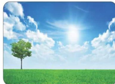
A hot and sunny day

On a sunny day, the sun shines brightly. The weather is hot. We wear cotton clothes on a hot day.